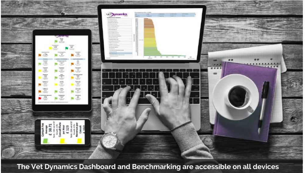
The Vet Dynamics Dashboard and Benchmarking are accessible on all devices

Vet Dynamics understand how important it is to keep your finger on the pulse of your veterinary practice. The Vet Dynamics dashboard is our diagnostic analytics software, created to give you context from your PMS data and provide practical insights into the clinical and financial aspects of your business; at the touch of a button.